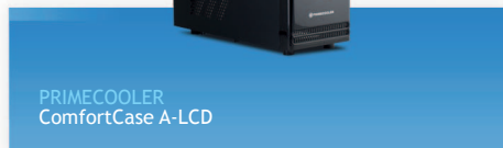
PRIMECOOLER ComfortCase A-LCD