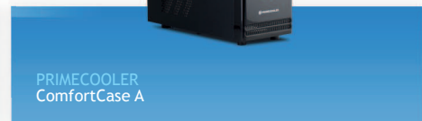
PRIMECOOLER ComfortCase A